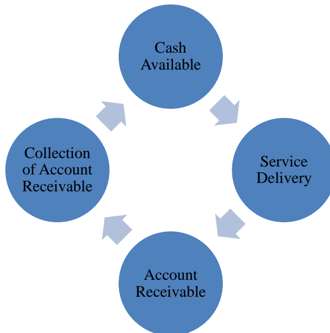
Figure 2: Working Capital Cycle in Service Organizations

Figure 1 distinctly explains the operational cycle of how an organization can move cash from purchasing to collection following sales. The applications of cash begin from the purchasing point of raw material for manufacturing of the items. The purchased raw materials bring into production process and before long it gets work in process from bought raw materials till the finished products or perhaps for all set to sales. When the goods are sold, the account receivables are produced until the cash received. Once again the cycle starts by using cash point as well as conclusion to cash collection.